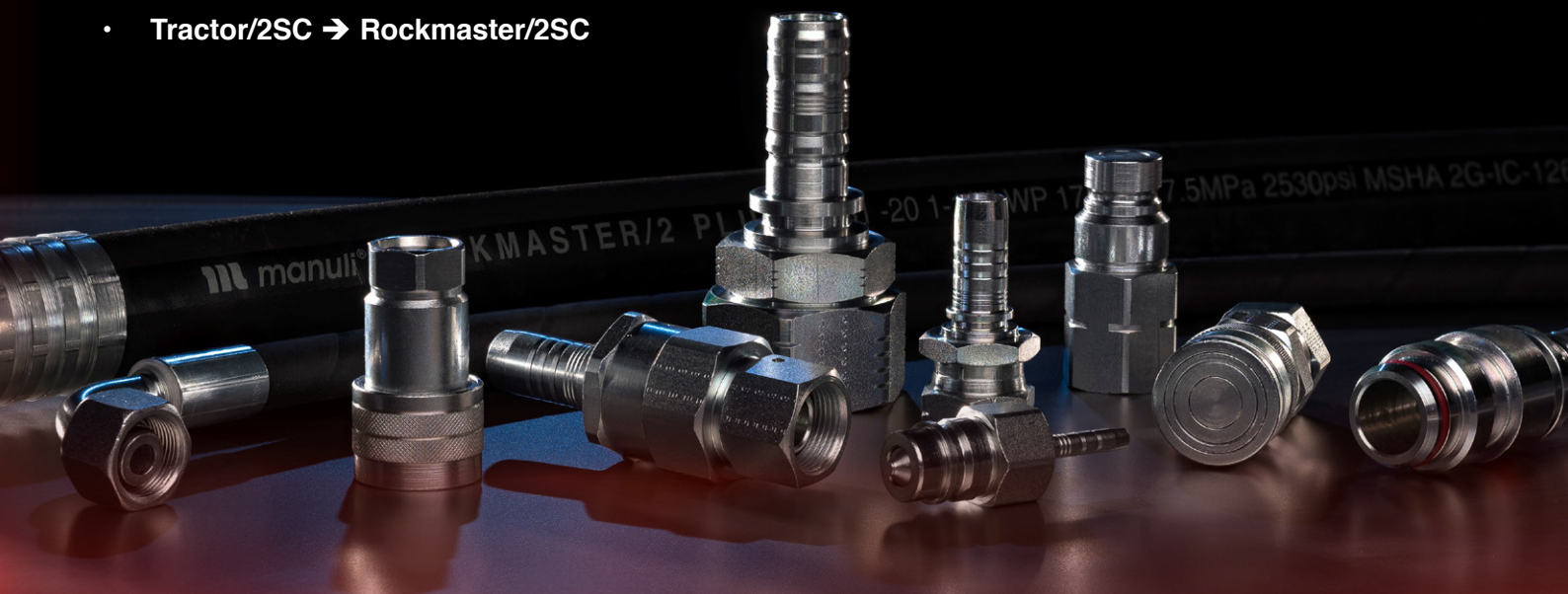
Abrasion Resistance 1