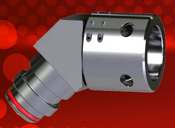
SH Series Double Thrust Wire Swivel