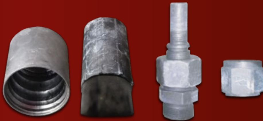
E-Coat 1000 after 1,000 hours ASTM B117 (ISO 9227) salt spray test