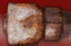
Competitor 2 after 1,000 hours ASTM B117 (ISO 9227) salt spray test