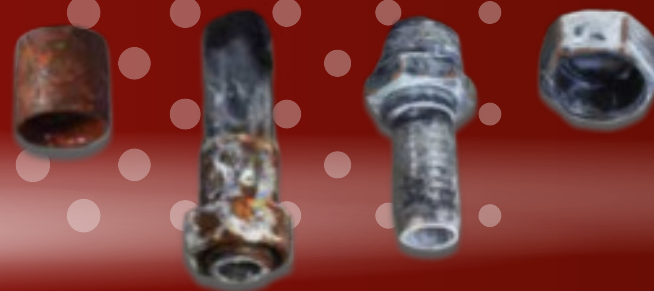
Competitor 1 after 1,000 hours ASTM B117 (ISO 9227) salt spray test