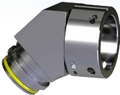
SA Series Single Thrust Wire Swivel

Provided by a single thrust wire in the SA series, and by a double thrust wire in the high-performance SH series, the swivel design provides additional benefits and flexibility to large bore adaptors.