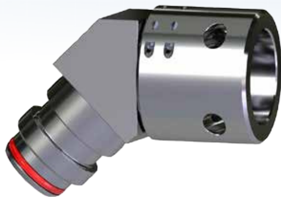
SH Series Double Thrust Wire Swivel